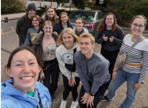
photo 1), volunteering at the Foot and Nail Clinic and at the Adopt-a-Block event in which they picked up trash following Homecoming (see photo 2).

in assisted living homes, conducted fundraisers and collected socks and supplies to